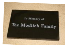
Sample of plaque that will be anchored in ground near the memorial.

For a donation of $850, we will install a garden bench and erect a plaque. The bench could be placed along a pathway or around one of our lakes. The plaque will be engraved with the donating family's name or the name of the person being honored.