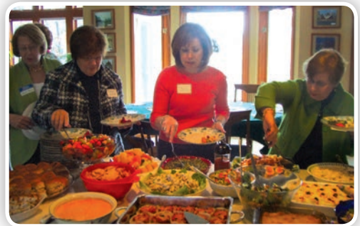
Check it out. These gardeners can cook!!!